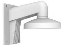
DS-1473ZJ-155 Wall Mount